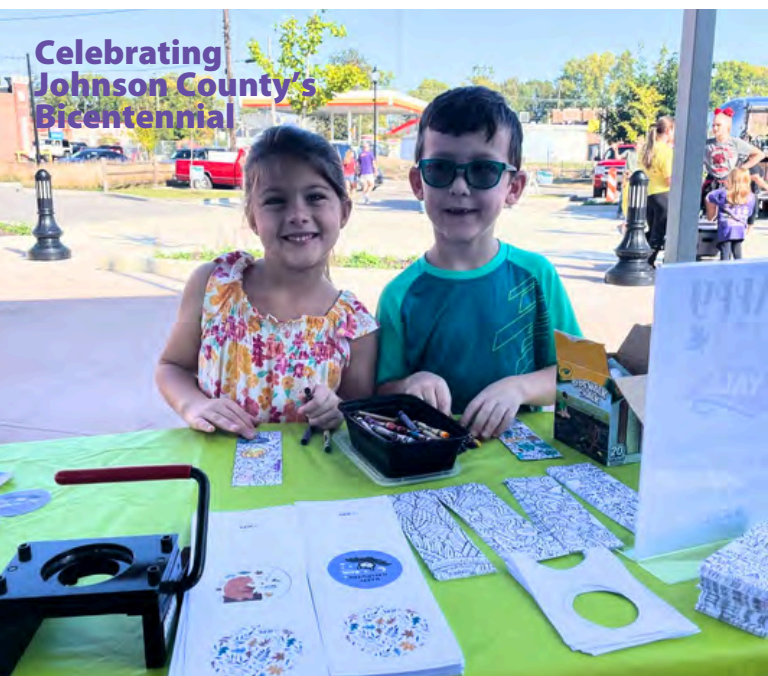
Celebrating Johnson County's Bicentennial