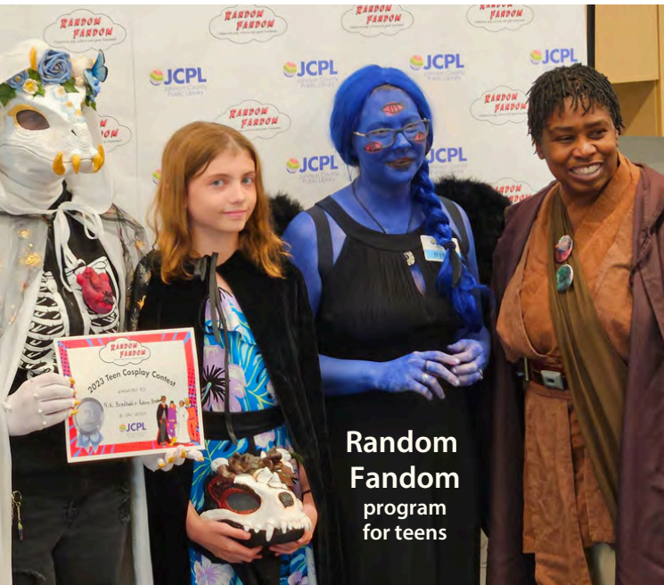
Random Fandom program for teens

Thank you, Rotary! FOR MAKING THE EXPLORATION WALK POSSIBLE