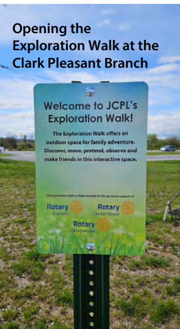
Opening the Exploration Walk at the Clark Pleasant Branch