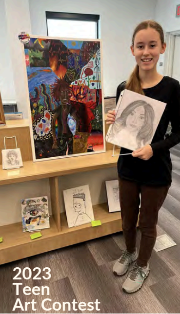
2023 Teen Art Contest

Dedicating Art at the Clark Pleasant Branch Funded by gifts from the community and JOHNSON COUNTY COMMUNITY FOUNDATION